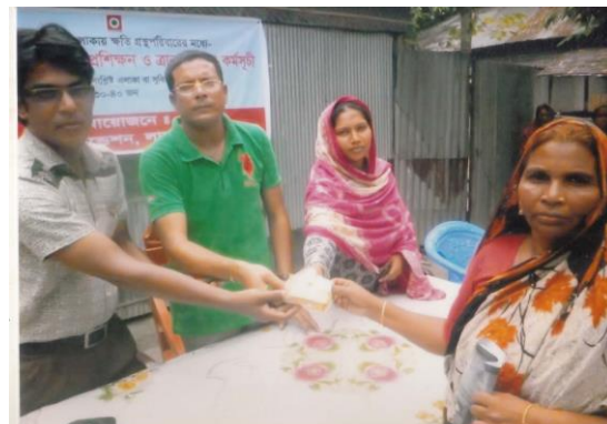
(Kaligonj Upazila School watsan program & Flood Program Activities)