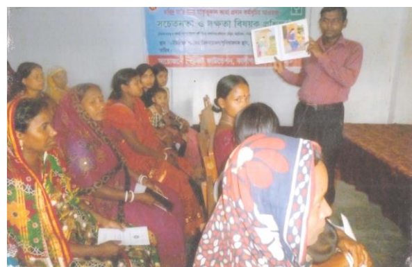
(Kaligonj Upazila training session on life-skills awareness development)