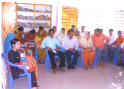
(Profit Foundation Library Setup Program)

In the reporting period profit foundation distribution on realizes book, organized seminar, meeting, iftari and dower several time. Total 150 people support received for 30 days iftari in the holly Ramadan. Profit Foundation develop a library for development on different issue in the area like- social, development, agriculture, cultural etc. In the reporting period organization purchase and collection 50 books in different issue. In the period conduct capacity building training/workshop 380 people for different issue cultural activities. All the support by the Ministry of Cultural and Religious + Ministry of Jubo Unnayan Govt. of Bangladesh. During the reporting period organization organized quiz activities for student capacity building. The issue is selected by the organization country, science, computer, geography, society etc. The local administration, local civil society member and educationist are attained the program.