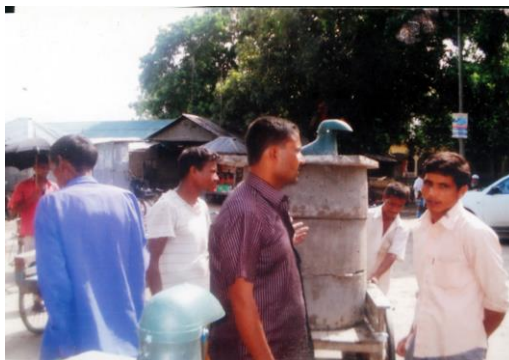
(Hard Poor Ring-slab Distribution Modati UP, Kaligonj, Lalmonirhat)

It is altogether a motivational program and also a supporting program to accelerate group activities. Discussions were held throughout the reporting period in the groups about the themes of environmental pollution and measures to bring back ecological balance. Group members were motivated to use safe water in the interest of health and hygiene and to install water scaled latrines. 1203 persons were involved in the program. In the reporting