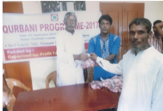
(Kaligonj Upazila Modity & Dalogram UP Qurbani Progrmme-2017)