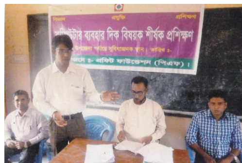
(Kaligonj Upazila Generation for youth, women and men awareness & Skill Training ICT)