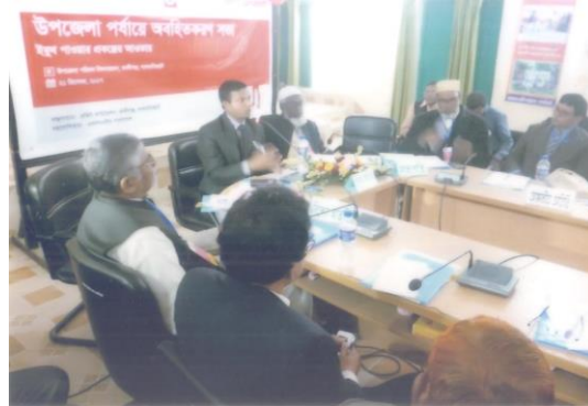
(Upazila level shearing Meeting with the official on Youth Power Project & Sanitation Program)

Institution level. It also develops sanitation skills of the beneficiaries for self-help sanitation practices in their daily lives. The project also develops linkages and networks with sanitation service institutions for delivering sanitation services to the communities resulting in 100% sanitation at community level. Apart from the interventions, the project also conducts discussion meeting with civil society groups, local government institutions and target stakeholders for mass awareness building on water and sanitation resulting in reducing insanitation and water born diseases in the communities.