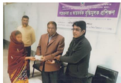
(Kaligonj Upazila Kakina & Tuvandhar UP Awareness & Skill Development Program)