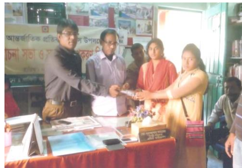
(International, National disability day & Development disabled people and stall)