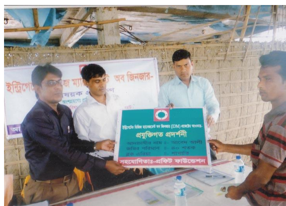
(Kaligonj Upazila Program Research IDM Project )

In the reporting period Profit Foundation conduct research on Innovative Idea on since and technology issue. In the period Profit Foundation organization Seminar, Symposium, Workshop, Publication of Book, Leaflet distribution and capacity building training. Total 100 participants received the training on the issue of science and technology. The project support by since, technology and Information Ministry govt. of Bangladesh.