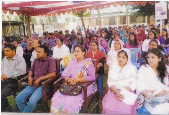
(National Anti drug Day Program)

The reporting period Profit Foundation organized capacity building activities, orientation workshop, rally, day observation, distribution leaflet, booklet/handbill etc. for different public gathering in favor of anti drug tobacco and environment also no smoking in any where. The capacity building of the period 450 awareness on different issue in social, health, Environment under the support WBB Trust and BATA. And objectives of the activities- to ensure terrorism free society, to ensure safety society, to ensure proper environment. The various activities down by the organization like- motivation, skill development training and local policy activities in the area. Output of the activities- ♦ Much people Awarded on Anti drug and anti tobacco and ♦ Health status has increased.