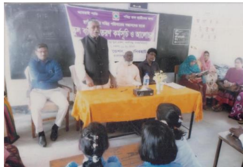
(Kaligonj Upazila Community Based Rehabilitation Support Disabled People & School Bag)